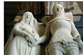
The Arundel Tomb

Richard Fitzalan (d.1376), Earl of Arundel and his Countess, the inspiration for a poem by Philip Larkin.