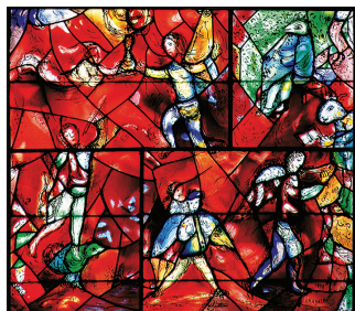
The Chagall window (detail)- see 13