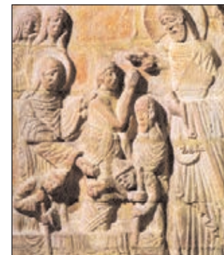
The raising of Lazarus - see 6

Here is an opportunity to experience something ancient yet modern, to reflect on what really matters, and perhaps to light a candle for someone in need.