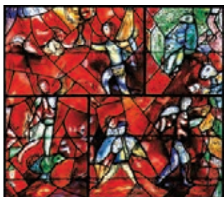
The Chagall window (detail)- see 13

Early 15th century. The screen was removed in 1859 and restored to its original place in 1961.