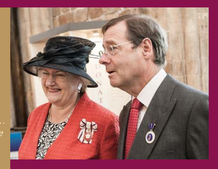
'It was lovely to see a cathedral so well used and very much part of the community. Everyone we spoke to was really passionate and totally welcoming.... This was a pleasure to visit.' (TripAdvisor)

Looking further outwards, our role in the community was explored in new and different ways, for example, through new uses of the Nave. Two special