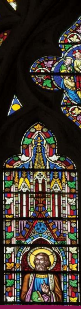
'It really is a glorious bouse of God'