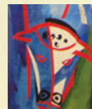
Detail from Piper Tapestry

Saturday 17 th November 1.30pm – 5.00pm ● Gospel Day: 'Learning with Luke' – An afternoon at Chichester Cathedral to explore and celebrate St Luke's Gospel through word, music, prayer and art.'