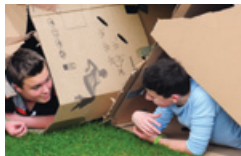
Stonepillow Sleep Out

Saturday 13 th October – Sunday 14 th October Stonepillow Sleep Out 2018 (in the Cathedral precincts)