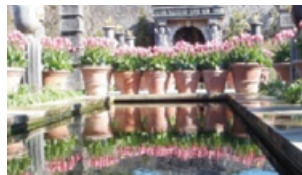
Arundel Castle Garden