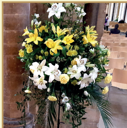
Flower Arrangement Sponsorship £2,000