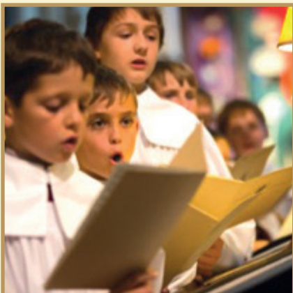
Chorister Sponsorship £60,000

Here are some examples of things we've done recently.