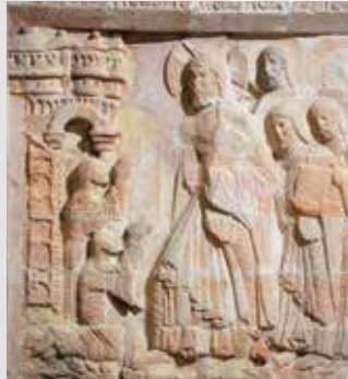
6: The Raising of Lazarus (detail)

Eternal God, thank you for the gift of your holy Word. Keep me faithful to its teaching and wisdom, and to the one to whom it witnesses, Jesus Christ our Lord.